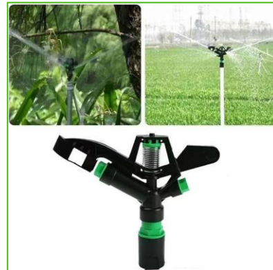
Sprinkler Irrigation kits