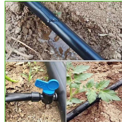
Drip Irrigation Kits