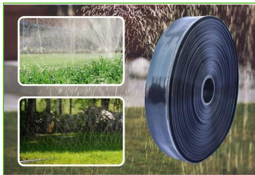
Laser Rain Spray Watering Hose Irrigation Kits