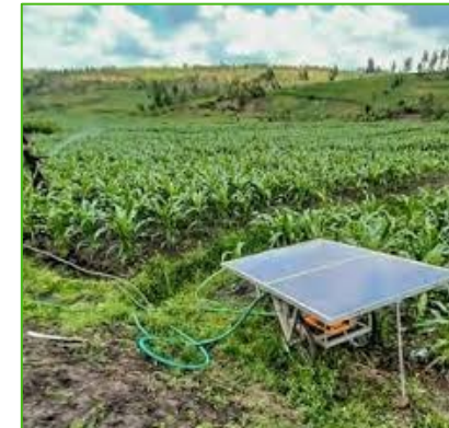
Ennos sunlight pump Kit